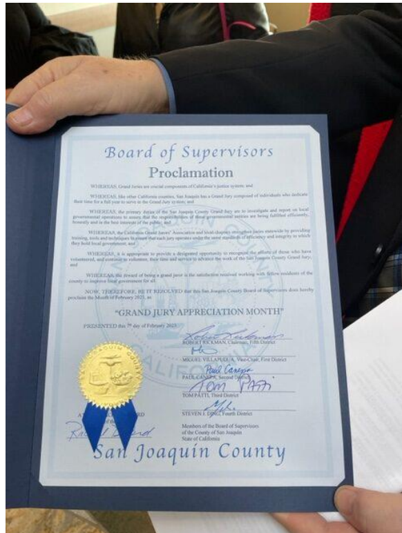
GJ Awareness Certificate